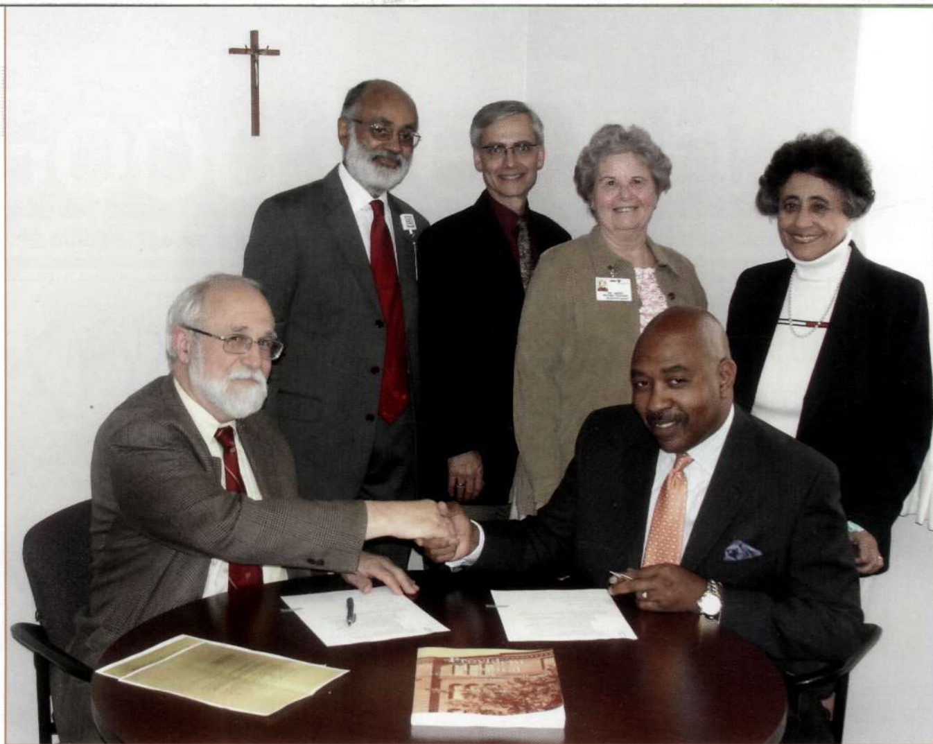
History changing hands

American History and Culture, including photographs, donor/contributor plaques, medical instruments, a panel listing of doctors' names and phone numbers, hospital pamphlets and original paintings that once adorned the hospital's walls.